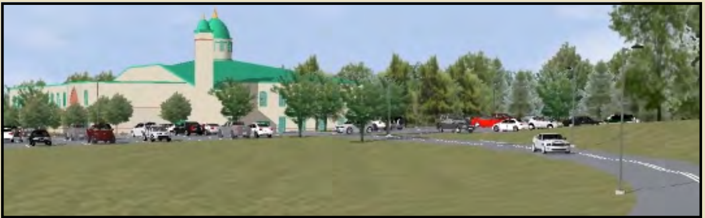
Architect rendering of the ISCN Y Community Center

It is the benefit of the believers to spend from that which Allah has lent them hoping to attain His Great Reward. The ISCN Y Community Center is worthy of your Sadaqat. So, no matter how large or small, ISCN Y Community Center needs you!